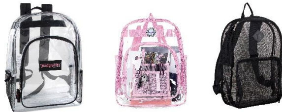
Clear or Mesh Backpacks ONLY